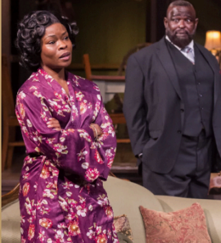
The Piano Lesson, 2024