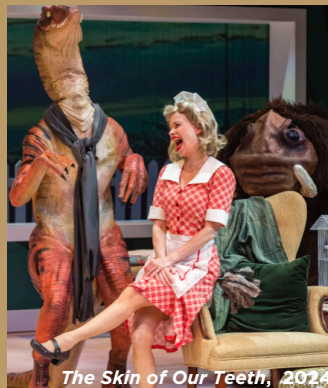
The Skin of Our Teeth, 2024